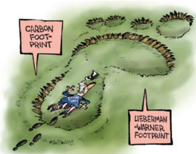
Eric Allie, Caglecartoons.com

The legislation was likely derailed for the remainder of 2008 when on June 6 proponents failed to invoke cloture on the Boxer substitute amendment. Invoking cloture would have limited debate so that the bill could come up for a vote. The cloture vote failed 48-36 (Roll Call 145), a dozen short of the 60 needed under Senate rules. We have assigned pluses to the “nays” because mandates on greenhouse-gas emissions are not constitutionally authorized and would harm the economy. ■